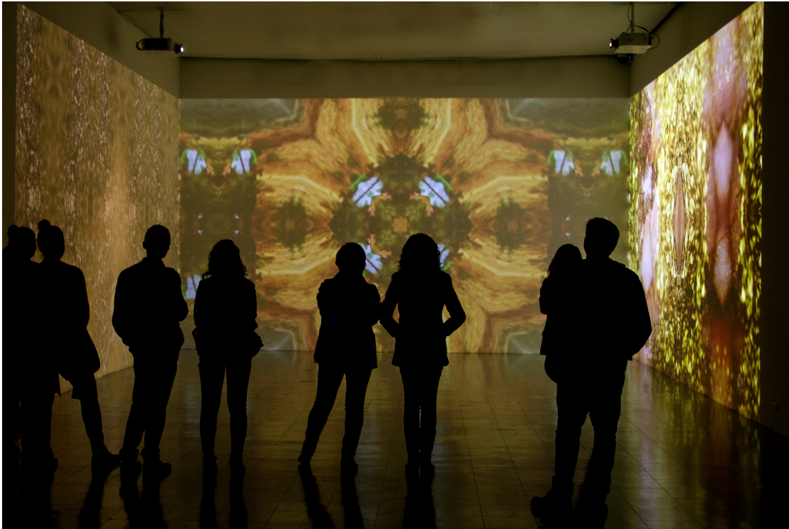
Installation View at Conjuro de Rios . Museum of Art, National University Bogota. Sept 2018-March 2019.